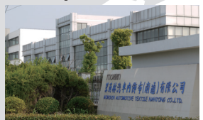
5 Moririn Automotive Textile (Nantong) Co., Ltd.