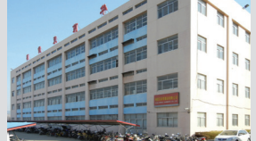
1 Qixia Morica Garments Co., Ltd.