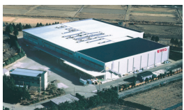
Moririn Logistics Co., Ltd. (Tsukuba Centre)