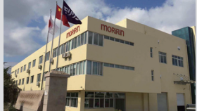
4 Shanghai Moririn Textile Co., Ltd. Qingdao Branch