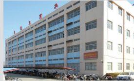
1 Qixia Morica Garments Co., Ltd.