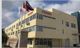
4 Shanghai Moririn Textile Co., Ltd. Qingdao Branch