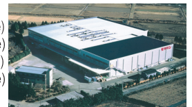
Moririn Logistics Co., Ltd. (Tsukuba Centre)