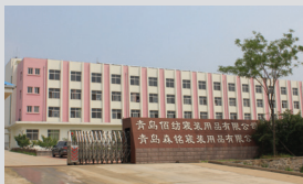
3 Qingdao Senming Bedclothes & Garment Co., Ltd.